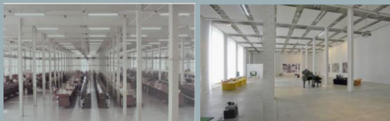
Figure 2: Recycle Materials With Indoor Use

THIS STUDY DEALS WITH THE PROCESS OF DESIGNING PRODUCTS USING WASTE MATERIALS AND THUS A PROCESS AIMED AT RECYCLING AND PRODUCTION. FOR THIS REASON, INCREASING THE AWARENESS IN THIS DIRECTION AND DIRECTING THE FUTURE STUDIES ARE THE MOST IMPORTANT TARGETS. THE CONNECTION DETAILS USED TO ASSEMBLE RECYCLED MATERIALS CAN BE MORE COMPLEX THAN THE CONNECTION DETAILS IN ANY OTHER PRODUCTION PROCESSES. THE COMBINATION OF DIFFICULT-TO-ASSEMBLE MATERIALS (SUCH AS PAPER ROLLS AND PACKAGING WASTE) NECESSITATES DIFFERENT SOLUTIONS. IT HAS BEEN ESTABLISHED THAT THE AMOUNT OF WASTE MATERIAL THAT CAN BE REACHED ALSO AFFECTS THE SCALE AND FUNCTION OF THE PRODUCT.