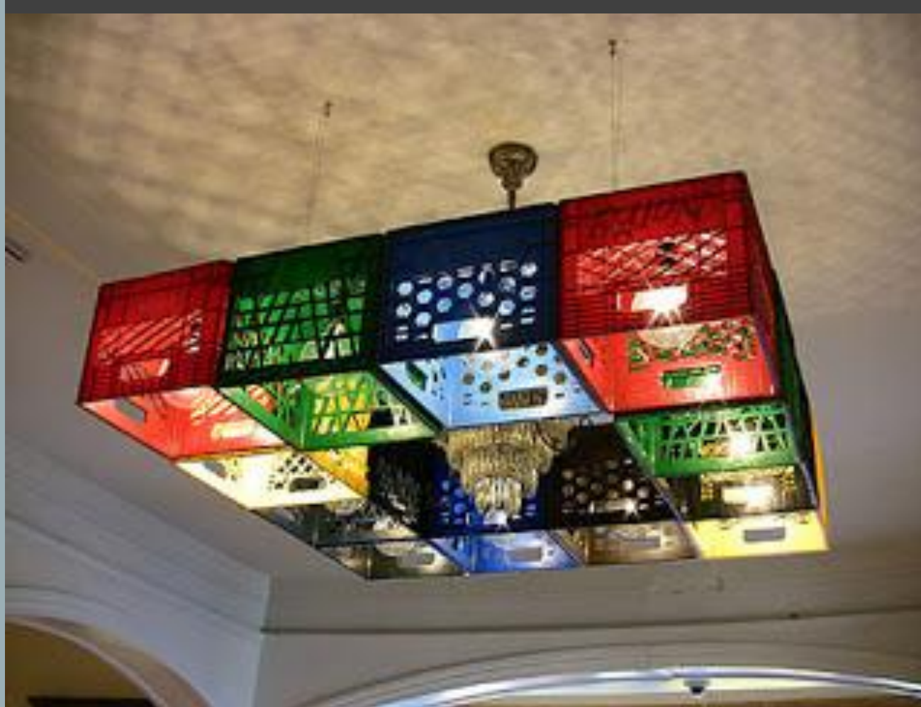
Figure 2: Example For Using Recycle Materials For Furniture Designs

IN THIS STUDY, PRODUCT DESIGNSS THAT ARE COMPOSED OF WASTE MATERIALS AND DESIGNED AND PRODUCED BASED ON THE PRINCIPLES OF REUSE, ARE DISCUSSED. THE AIM OF THE STUDY IS TO CREATE AWARENESS THAT ENVIRONMENTAL POLLUTION MAY BE AVOIDED THROUGH REUSE. MATERIALS, METHODS, OUTPUTS AND RESULTS ARE PRESENTED UNDER THE RELEVANT HEADINGS.